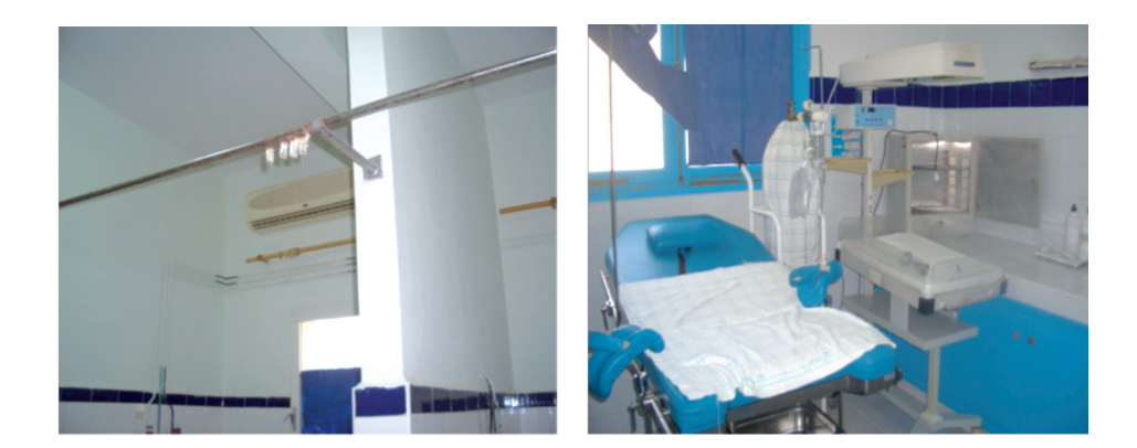
Figure 2: Delivery Room Renovations to Promote Privacy and Quality of Care

Sixteen maternity hospitals were renovated in 2008. In 2011, the program was expanded to other maternity hospitals and health center maternity units. The renovations of these facilities allowed women to receive 48 hours of post-partum care (which became mandatory) in acceptable living conditions. Facilities added reception and waiting areas, permitted family members to wait onsite, and greatly increased the privacy of delivery rooms.