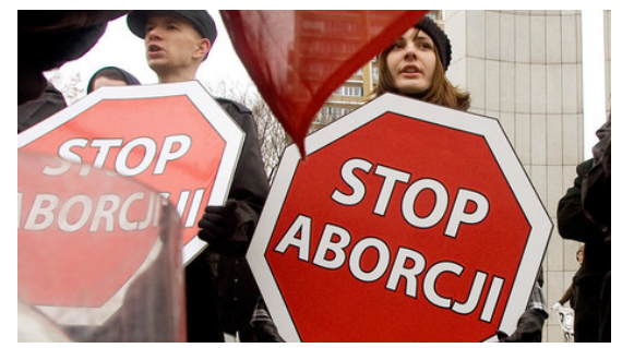
Pro-life vs pro-choice: Protest over abortion ban law in Poland rages online

Speakers at the rally said planned legislation that would make abortion illegal even for women who are victims of incest or rape or whose lives were endangered by a pregnancy would be "barbaric."