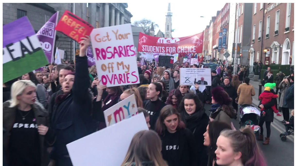
more on Ireland (https://www.aljazeera.com/topics/country/ireland.html)

pealthe8th?ref_src=twsrc%5Egoogle%7Ctwcamp%5Eserp%7Ctwgr%5Ehashtag) and make May 25 a day to celebrate!