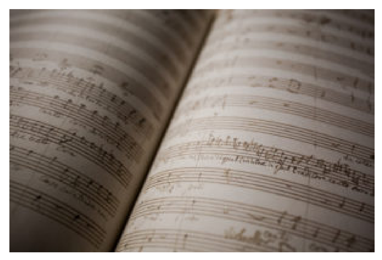
What Do You Do With a Bachelor of Music?