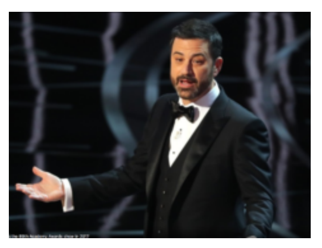
Sorry Oscars, You Can't Applaud Progress You Haven't Made Yet