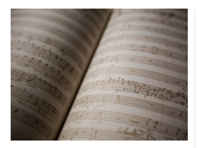
What Do You Do With a Bachelor of Music?