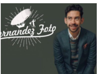
Reinventing the Photo Studio: Fernandez Foto Captures the Spirit of DIY Photography