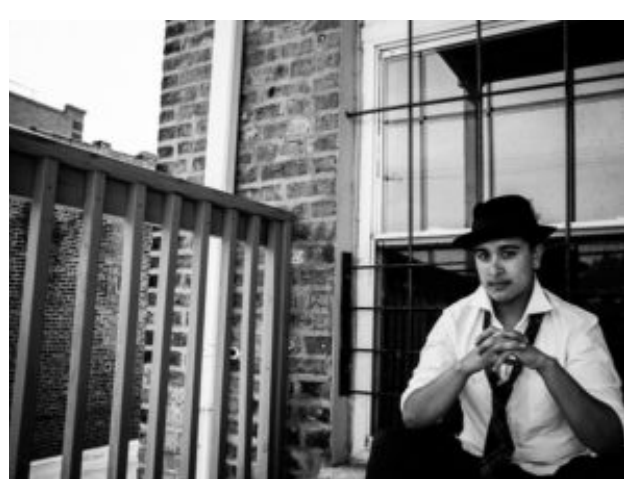
DIY Quotes from DIY Folx: Selling Out