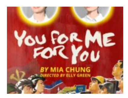
Scapi DIY Theater and Performance: March 2018 BY DANIELLE LEVSKY ON FEBRUARY 23, 2018