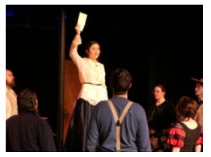
All In The Family: The Varied Rehearsal Processes of the Chicago Musical Theatre Festival