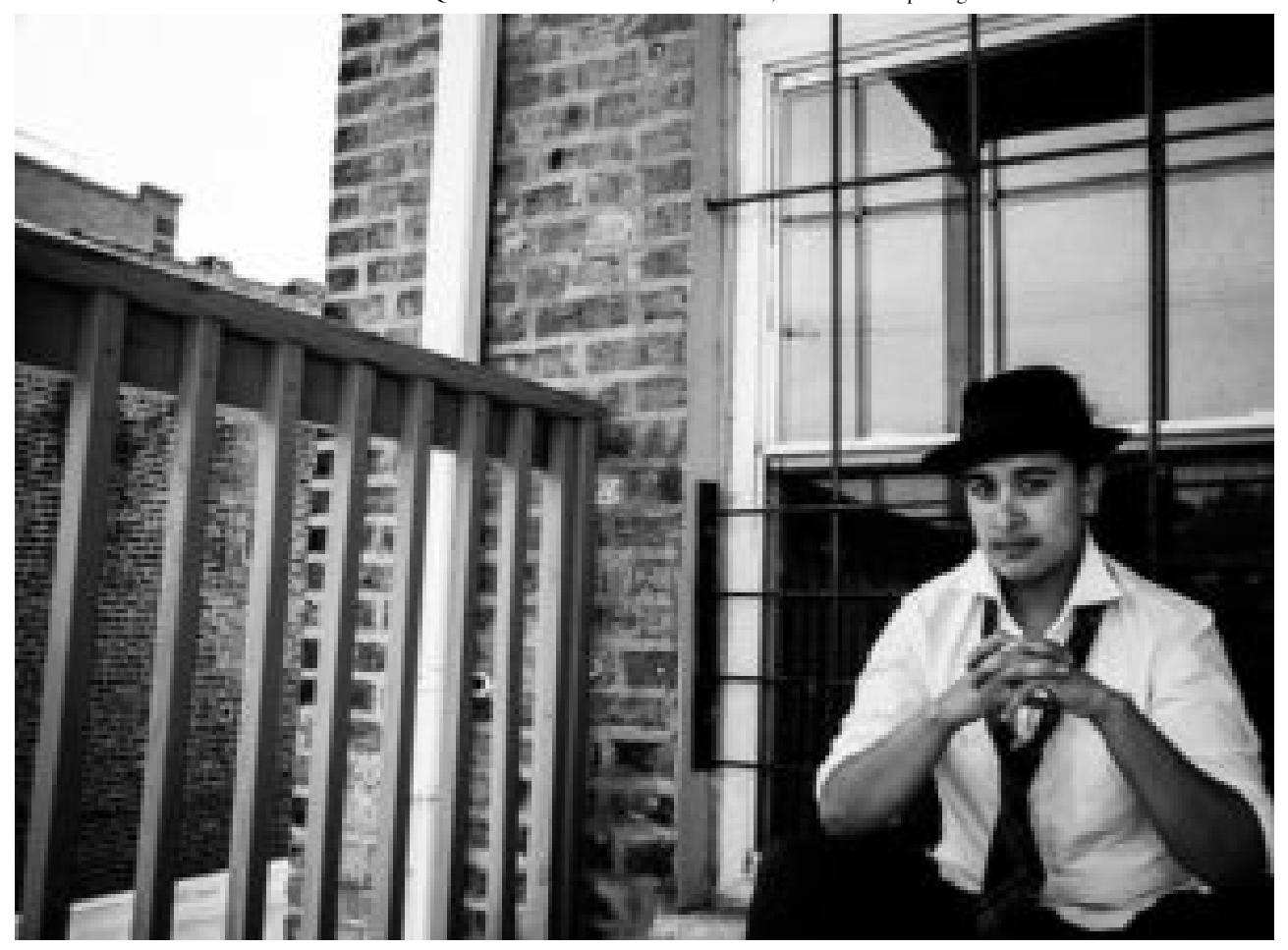
DIY Quotes from DIY Folx: Selling Out