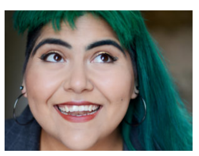
DIY Quotes from DIY Folx: DIY Definitions