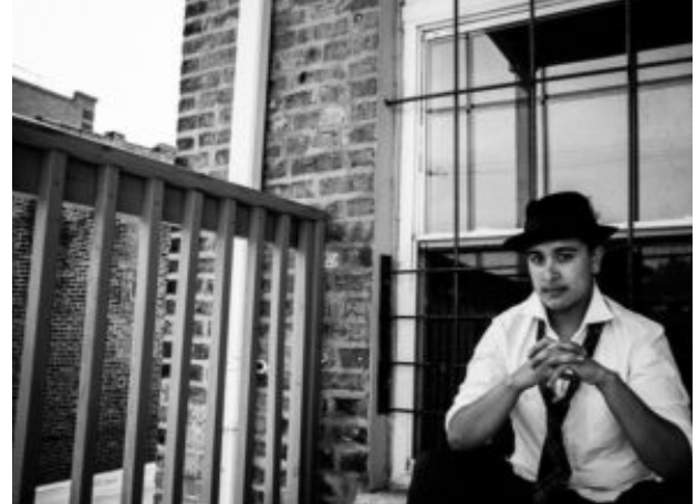
Wacky Wednesday: The Penguin is Here