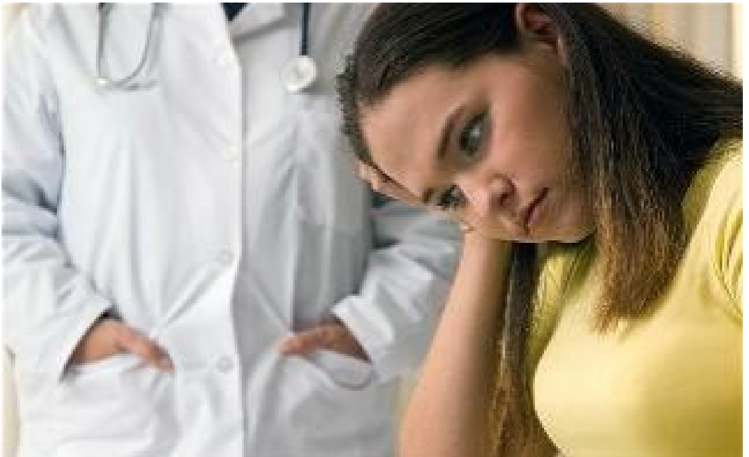
Abortion pills: Everything you need to know