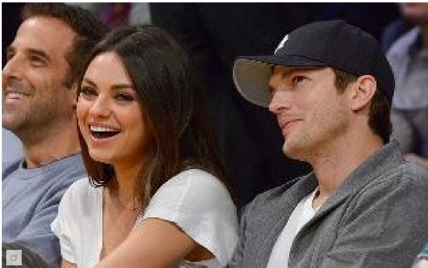
The weirdest and wisest fatherhood advice from celebrity dads