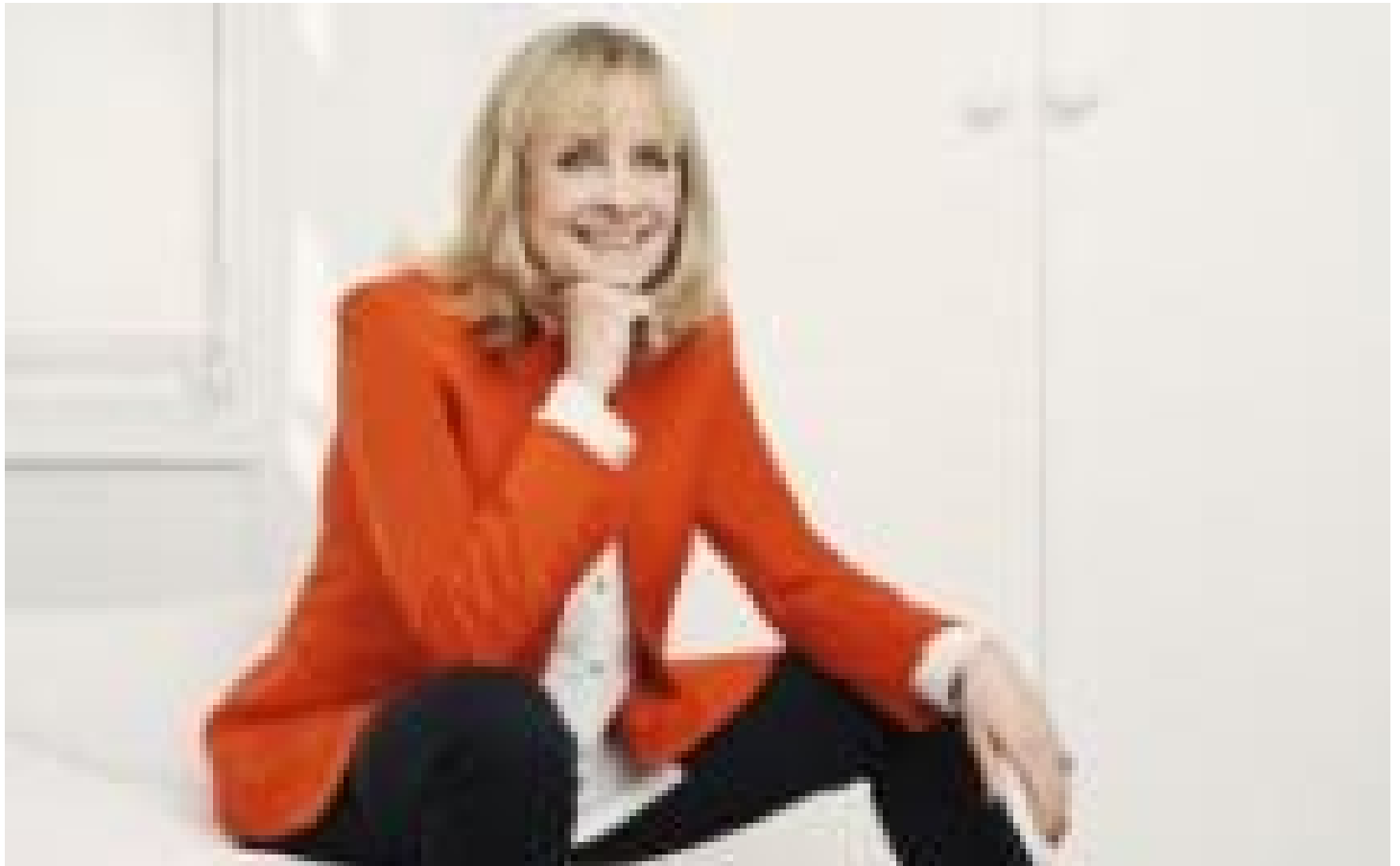
Twiggy: 'I'm lucky - I've never failed'