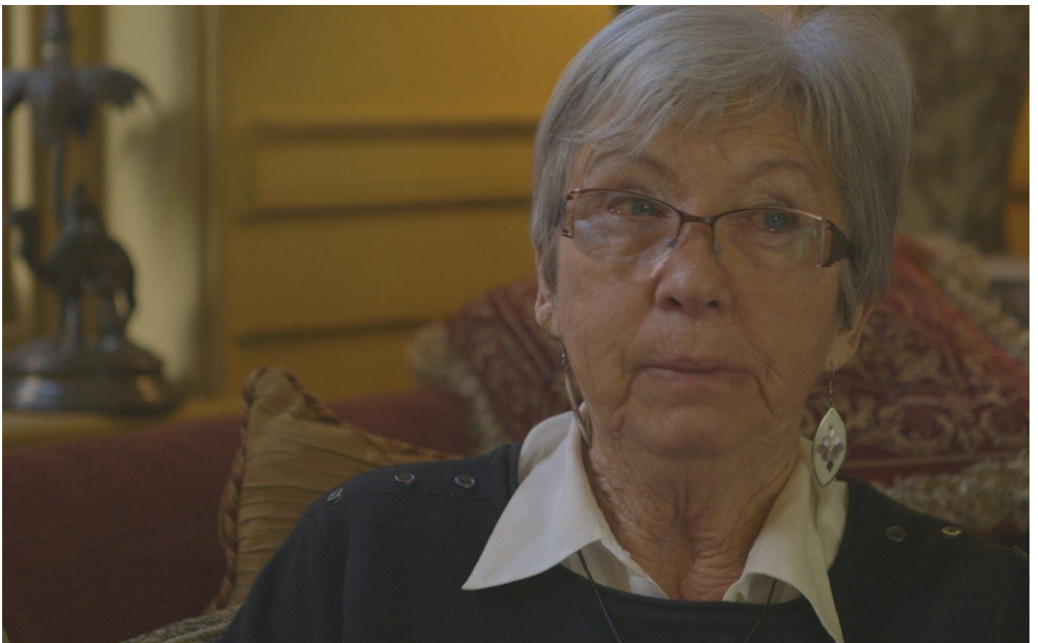
Why abuse victims wait until their twilight years to come forward