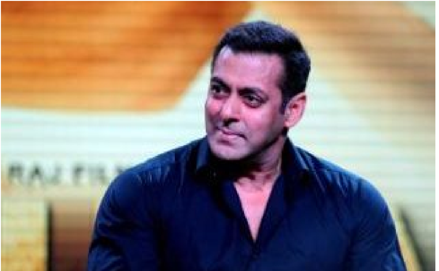
Bollywood's Salman Khan condemned for 'raped woman' joke