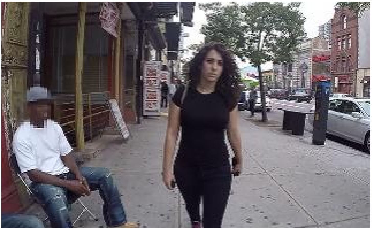
#NoWomanEver addresses aggressive street harassment