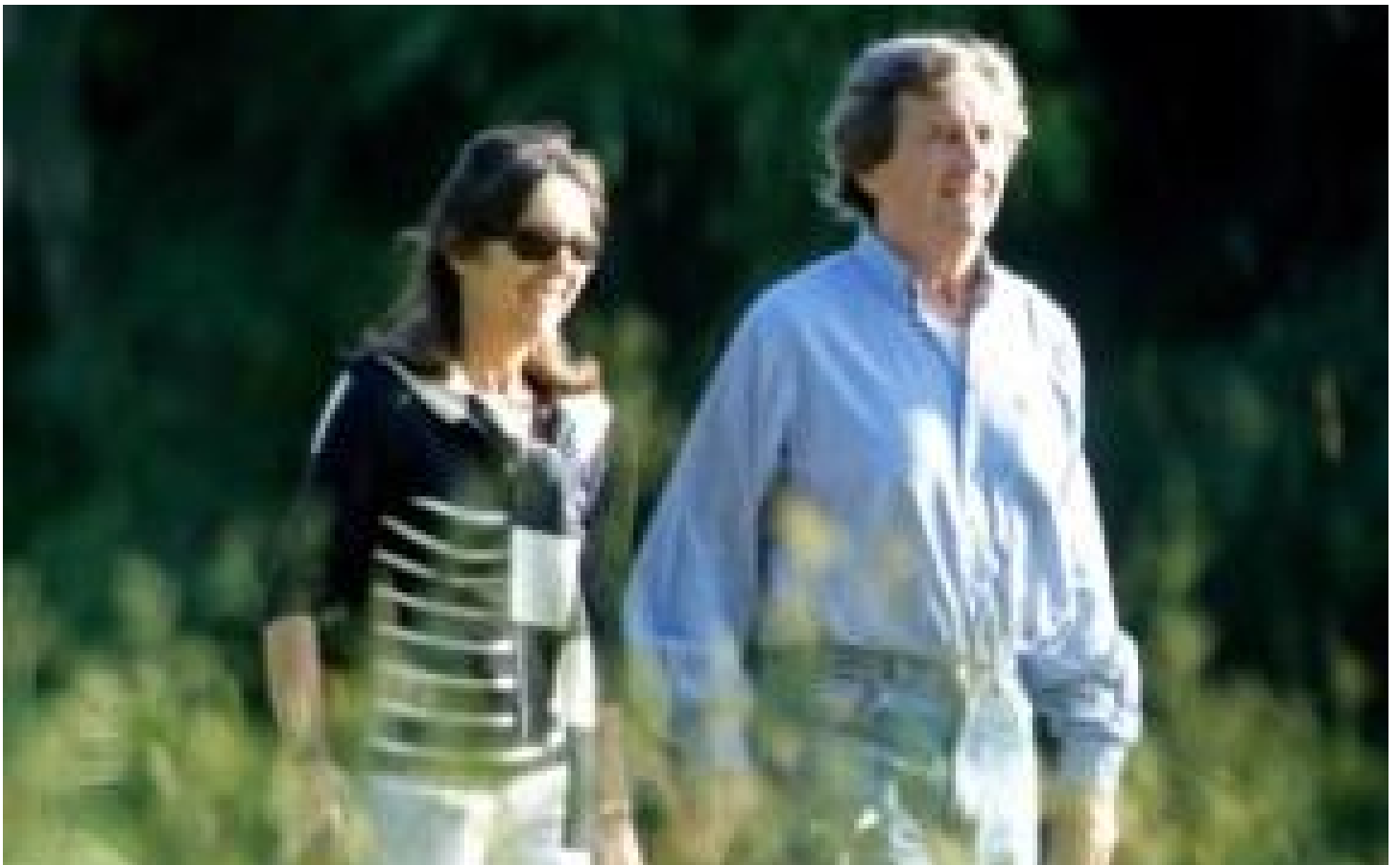
I like Melvyn Bragg. I had an affair - and years later, fell for my old flame all over again