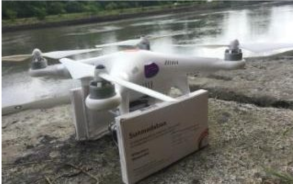
The drone carrying abortion pills which flew into Northern Ireland

The women who took the pills didn't disclose whether they were pregnant. A number of police officers were present at the landing site, but they did not confiscate the medication, which had been prescribed by two doctors.