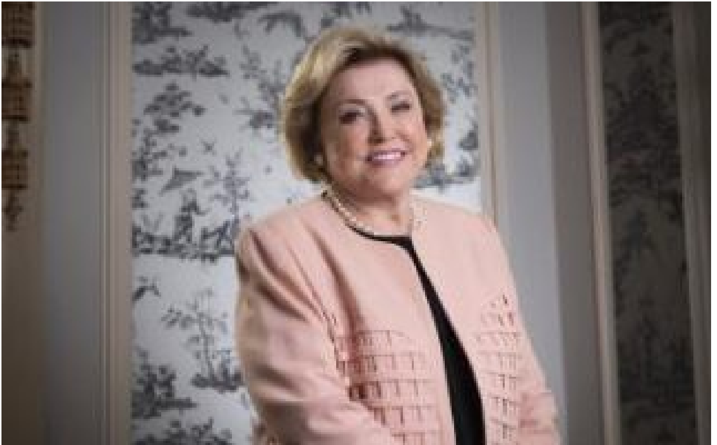
Barbara Taylor Bradford: 'What this referendum needs is Mrs Thatcher'