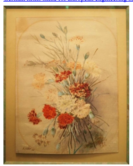
Gallery Hitler's paintings up for auction