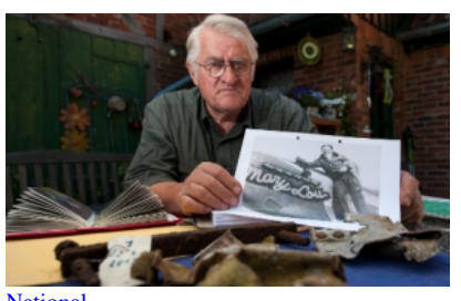
National German's 70-year search for murdered US pilot