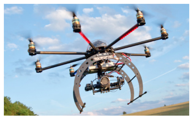
A drone flies through the Bavarian countryside.

The Queen will spend the second day of her fifth state visit to Germany in the country's financial heart before heading back to Berlin for a very British garden party. Check back throughout the day for live updates. READ