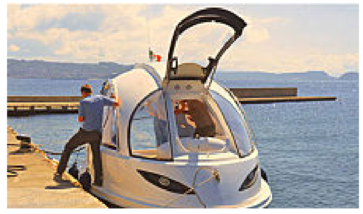
26 of the Weirdest Boats Ever Made!