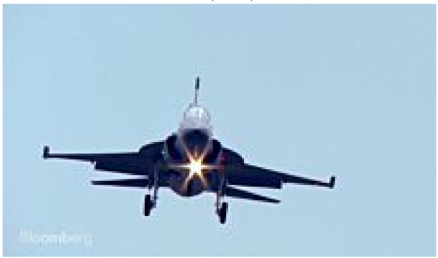
Bloomberg The China-Pakistan Fighter Jet Built on the Cheap