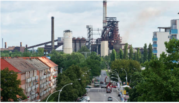
Eisenhüttenstadt near the Polish border.

A Dutch women's rights group said Thursday it will fly a drone carrying abortion pills into Poland this weekend to highlight the staunchly Catholic country's restrictive abortion laws. READ 7 comments