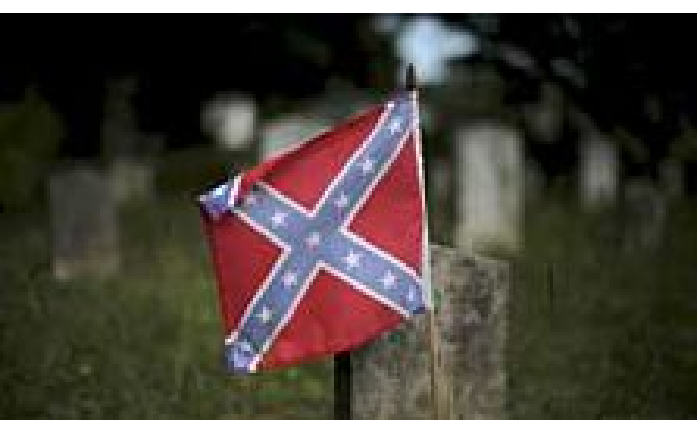
Five myths about why the South seceded (MSN)