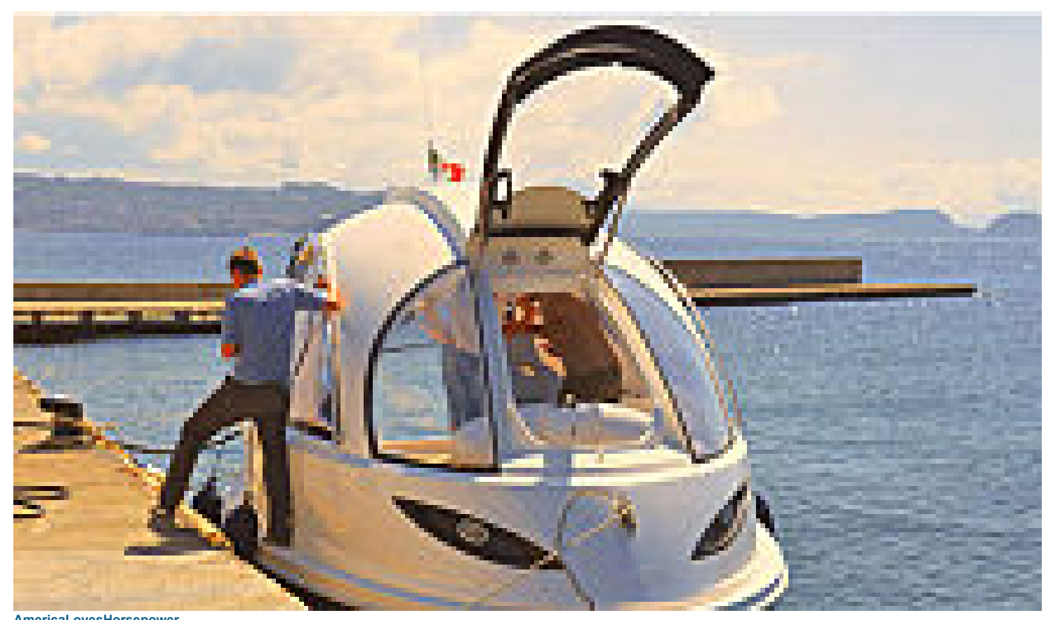
AmericaLovesHorsepower 26 of the Weirdest Boats Ever Made!