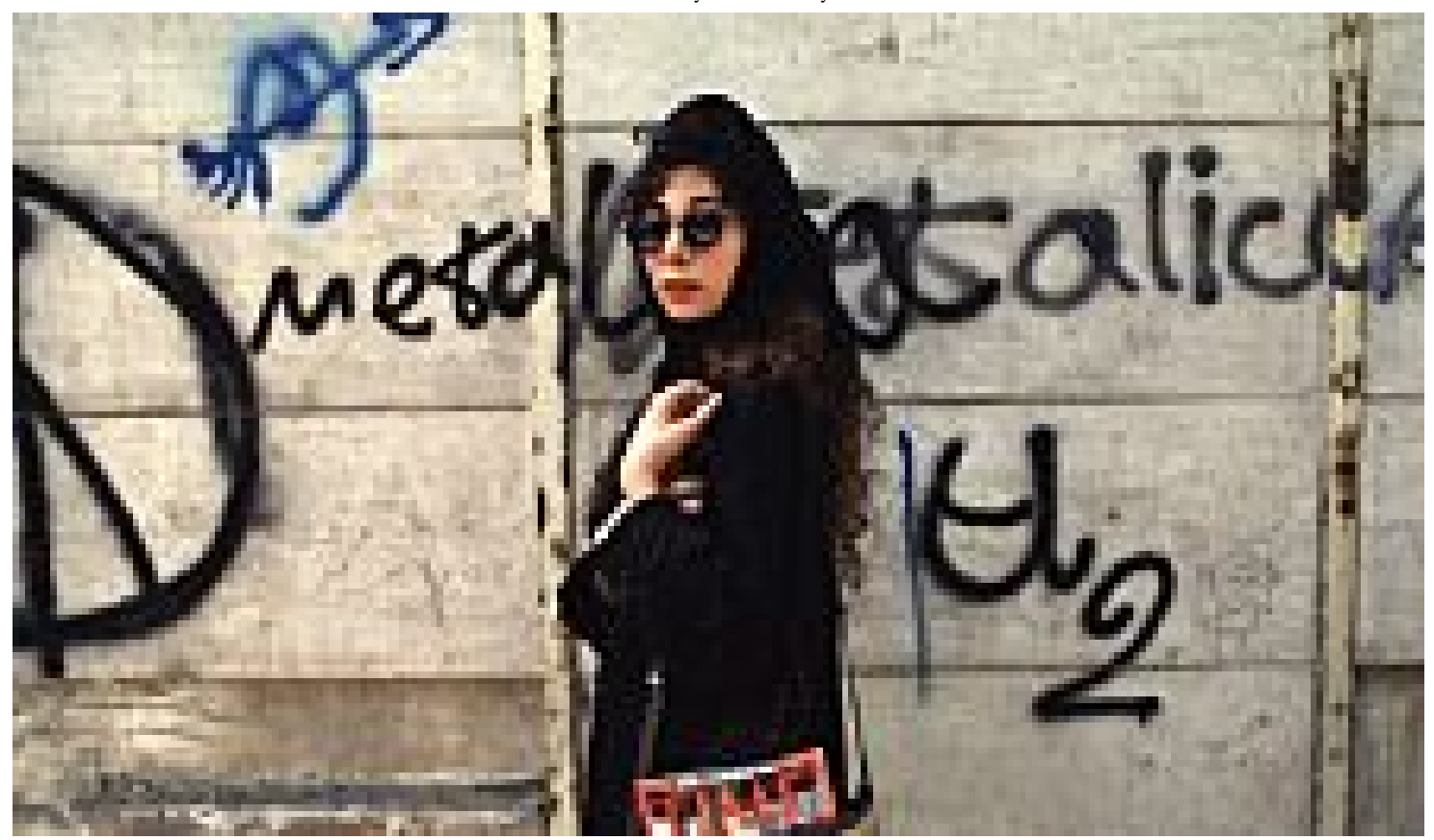
RantPlaces 15 Countries to Stay Away From If You're An American