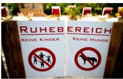
Rhineland Anger over 'child-free' beer garden