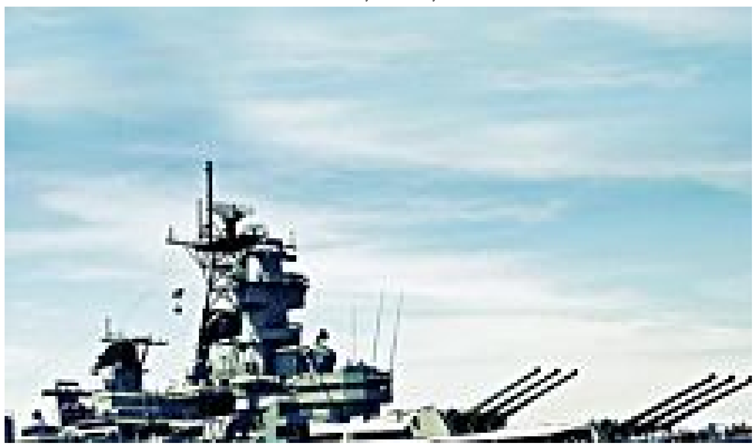
New Jersey Tourism Pursuing liberty in New Jersey: battlefields, a big ship and a station stop.