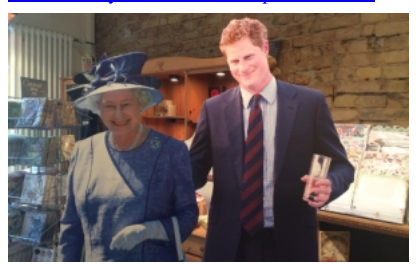
National British shop booms on eve of Queen's visit