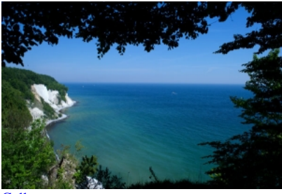
Gallery Germany's most beautiful cycle routes