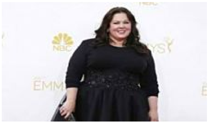
OMG... Melissa McCarthy is Looking GOOD! 13 Before and After Pics (Wizzed)