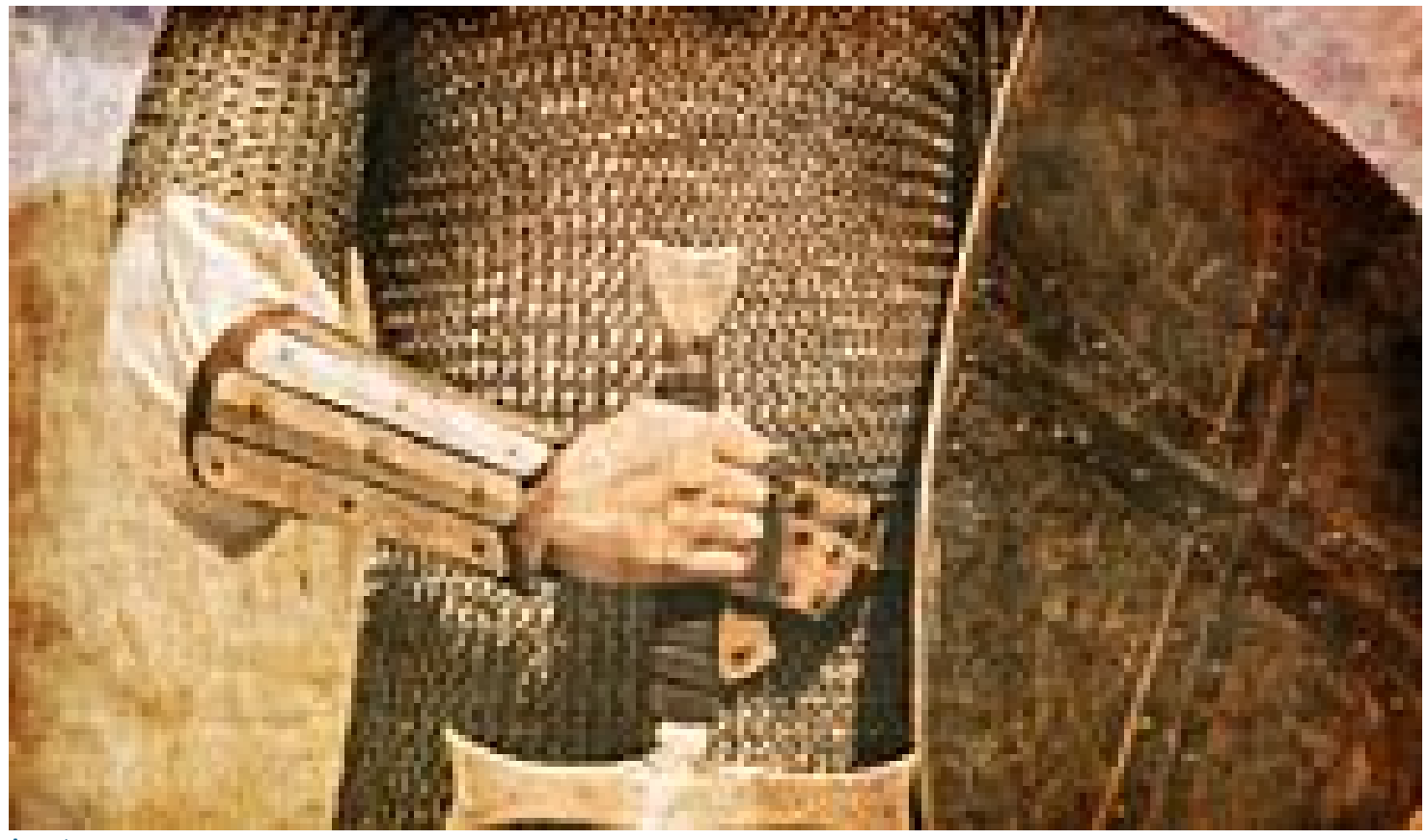
Ancestry What Does Your Last Name Say About You?