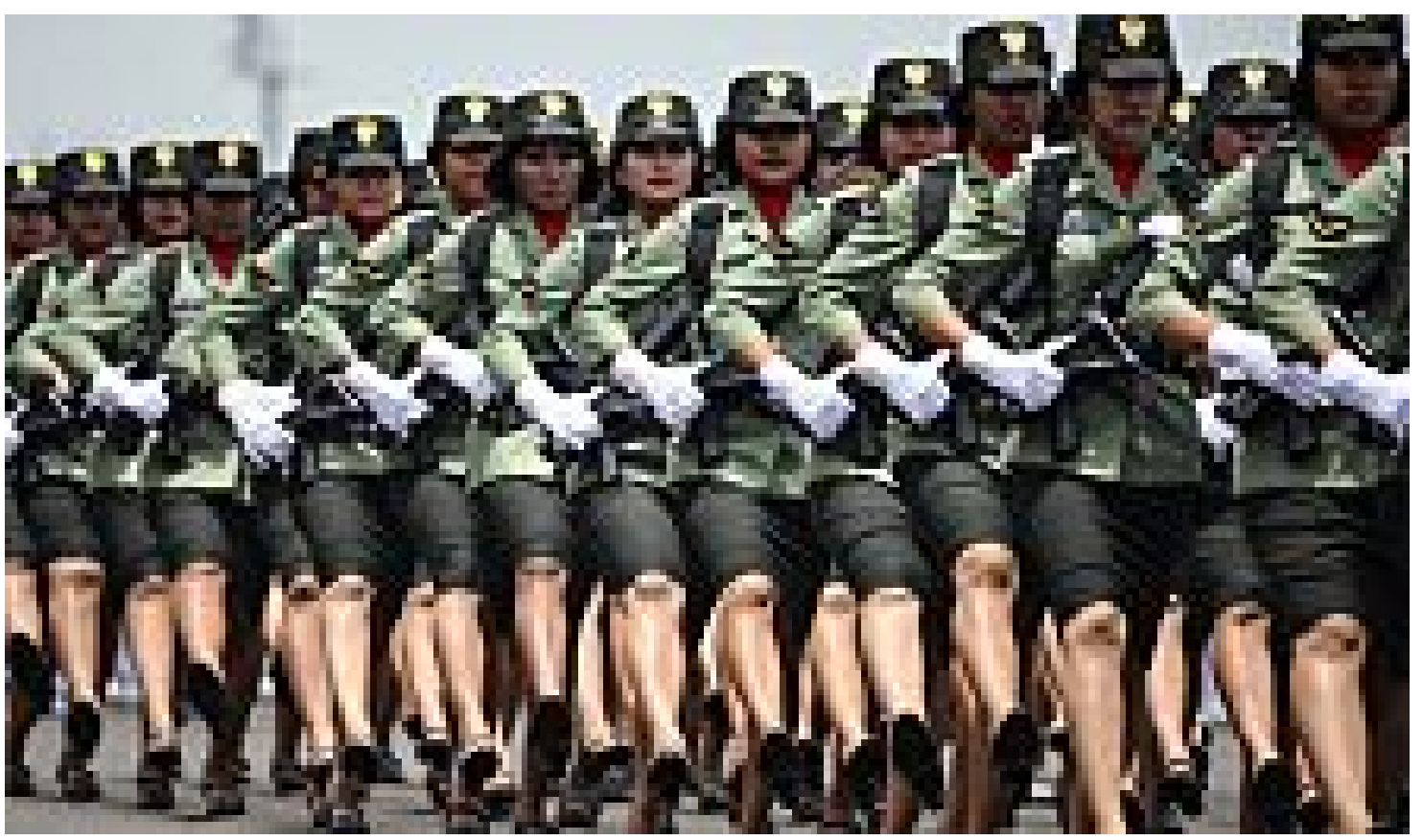
The Plaid Zebra Why the Indonesian military's "two finger test" on women needs to stop immediately