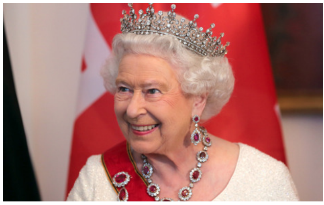
Queen Elizabeth II at a state dinner in Berlin on Wednesday evening.