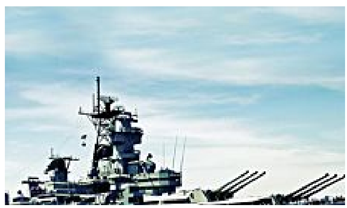
Pursuing liberty in New Jersey: battlefields, a big ship and a station stop.