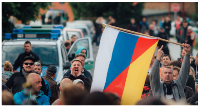
Demonstrators wave a half-German, half-Russian flag outside the refugee home.

IT experts warned this week that the website of the Bundestag (German parliament) is a potential "bridgehead" for hackers to gain access to MPs' data. READ