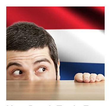
How Dutch Trade Fear For Profit