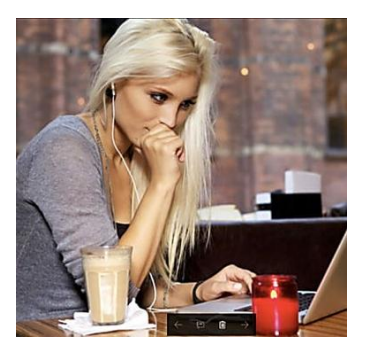
Mac Antivirus (2018) -Which #1 Antivirus Does Your Mac Need?