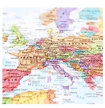
14 Best Places To Go In Europe With Kids