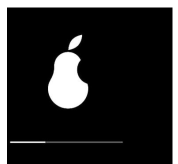
Top 10 Antivirus For Mac Users. #1 Is Free. (2018)