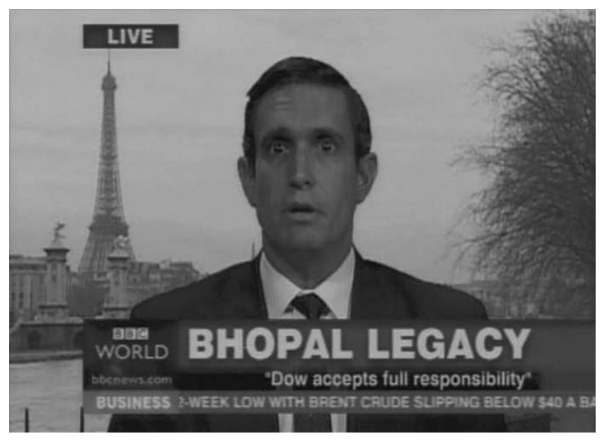
Figure 5 The Yes Men, Dow Bhopal (2004). Photo © The Yes Men (available under Creative Commons noncommercial 1.0 license). Color version available as an online enhancement.

abortions were thoroughly thwarted. Licensing and other technicalities kept them from giving any abortion-related treatments during the pilot program to Ireland (see Corbett 2001, 26; Gomperts 2002, n.p.). Later, with its claim that the ship posed a threat to national security worthy of deploying its navy, the government of Portugal was able to prevent Women on Waves from coming ashore at all, even for supplies and fuel.<sup>16</sup>