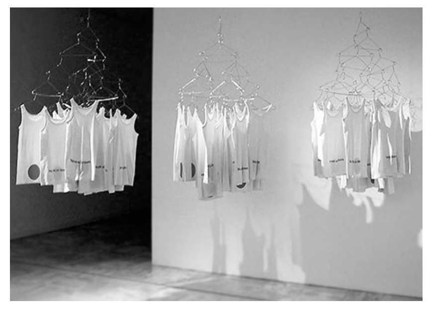
Figure 3 I Had an Abortion (2003). Installation designed by Willem Velthoven, at the Macedonian Museum of Contemporary Art, Thessaloniki, Greece. Photo: Willem Velthoven. © Women on Waves Foundation. Reprinted with permission. Color version available as an online enhancement.

particular activist project. And this activist project has been remarkably interested in using art to enable and extend its mission. In 2003 Gomperts and the Dutch artist and critic Willem Velthoven began exhibiting a series of installations that, in part, documented the abortion boat trips. In a video projection called Sea , for instance, the voices of women who called the boat's hotline in 2001 play over images of the open ocean. But the installations went beyond documentation, using the language and spaces of contemporary art to promote the project's vision of a normalized and safe abortion policy for all women (see fig. 3). For instance, a display of specially designed minidresses on hangers, each bearing on one side a red