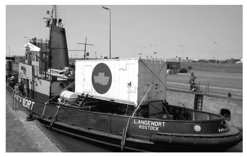
Figure 1 The Langenort , a ship rented for use by Women on Waves, with the mobile clinic aboard. In the Netherlands just before embarking to Poland. Color version available as an online enhancement.

that line, Gomperts had realized, the ship's doctors could offer all the advice and treatment available in a liberal nation like the Netherlands, including abortion. For it is Dutch law that governs a ship registered in the Netherlands afloat in international waters. So far, boats bearing the clinic have embarked for Ireland (2001), Poland (2003), and Portugal (2004), bringing the Netherlands to the shores—or at least to twelve miles from the shores—of countries where abortion, information on abortion, and even contraception are difficult to access.<sup>2</sup>