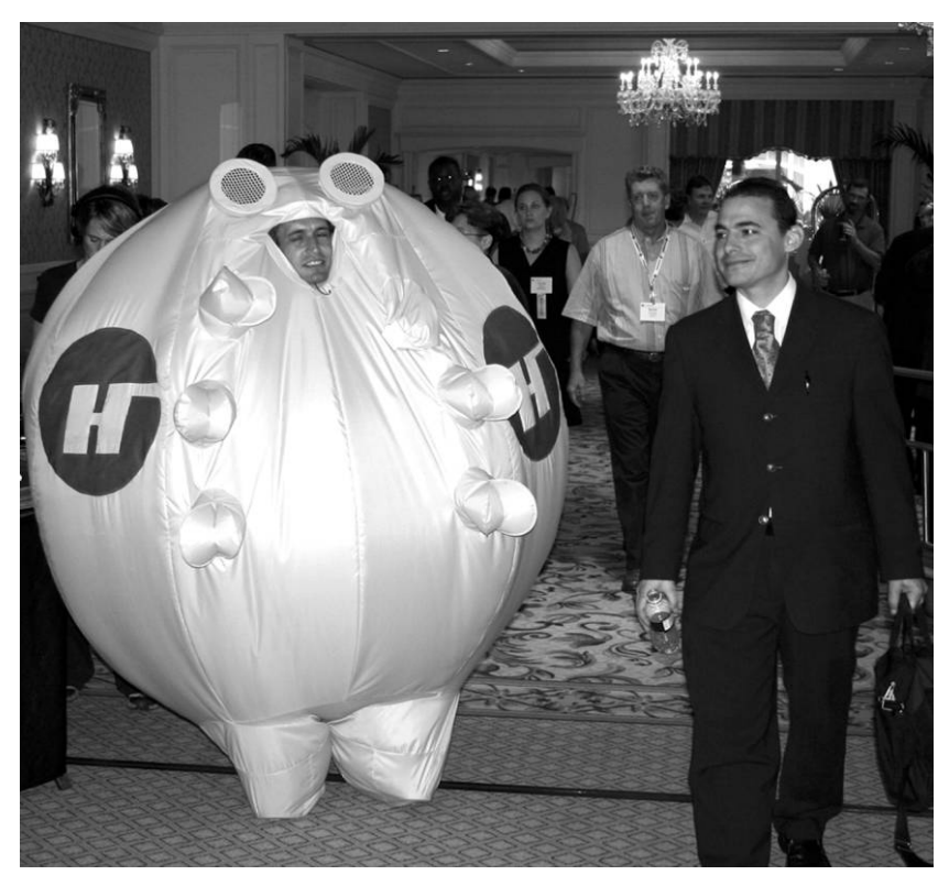
Figure 4 The Yes Men, Halliburton Solves Global Warming (2006). Catastophic Loss Conference, Amelia Island, Florida. Photo © The Yes Men (available under Creative Commons noncommercial 1.0 license). Color version available as an online enhancement.

the other hijinks. For while Gomperts insists on actually producing the condition of legal abortion that her project conjures in imagination, the Yes Men's strategy of impersonation means that they always operate in what J. L. Austin calls the "unhappy performative" (1976, 14). A statement like "Dow accepts responsibility" is similar to one like "I christen this ship." Both do something rather than represent something. Such speech acts are not judged true or untrue, but successful or unsuccessful, felicitous or infelicitous.