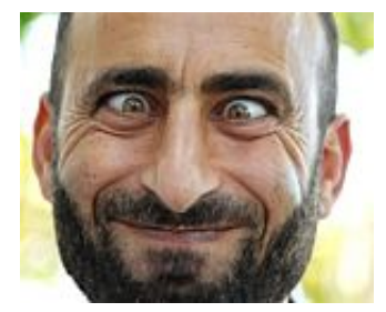
20/20 Vision Without Lazer Surgery Is Now Possible Restore My Vision