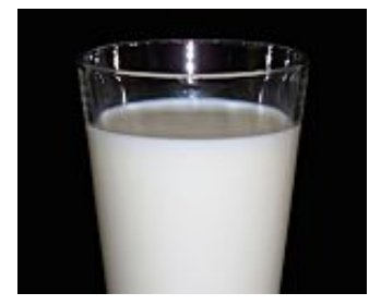
NEVER Drink These 2 Types Of MILK (cause weight gain & accelerat... The Fat Burning Kitchen Guide Book