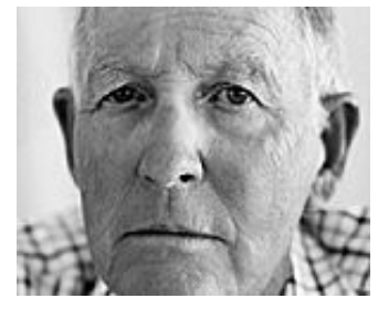
'Warren Buffett Indicator' Signals Collapse in Stock Market Newsmax

COMMENT RULES: Comments that are judged to be defamatory, abusive or in bad taste are not acceptable and contributors who consistently fall below certain criteria will be permanently blacklisted. The moderator will not enter into debate with individual contributors and the moderator's decision is final. It is Belfast Telegraph policy to close comments on court cases, tribunals and active legal investigations. We may also close comments on articles which are being targeted for abuse. Problems with commenting? customercare@belfasttelegraph.co.uk