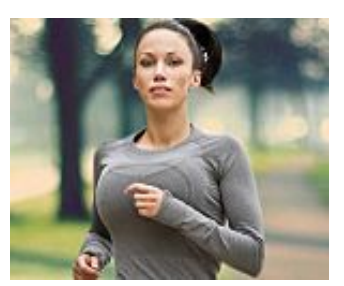
The 3 Worst Things that Age You Faster (AVOID) MAX Workouts Fitness Guide