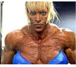
8 Women You Won't Believe Actually Exist LikeShareTweet