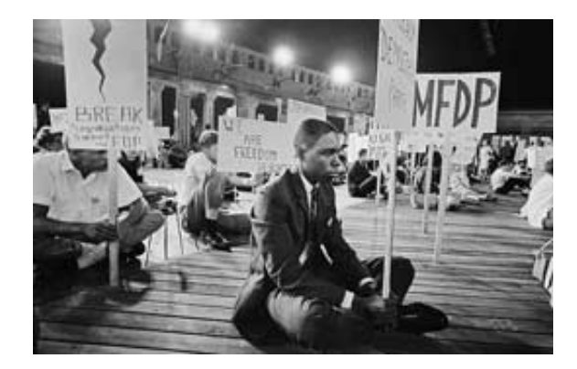
'FREEDOM SUMMER' – A scene from the film about the early days of the Civil Rights movement that screens at Mountainfilm this weekend.