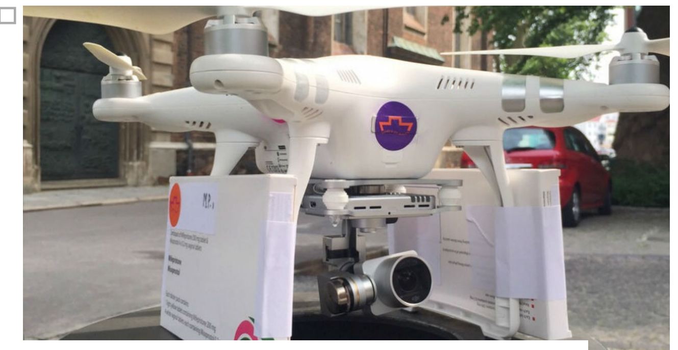
A Women on Waves drone, set to take off with abortion medication.

Share on Facebook Share Tweet on Twitter Share Share