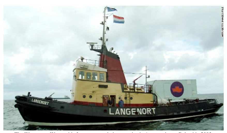
The Women on Waves ship Langenort took the organization's campaign to Poland in 2003.

October 4th, 2012 07:33 AM ET Share this on: Facebook Twitter Digg del.icio.us reddit MySpace StumbleUpon