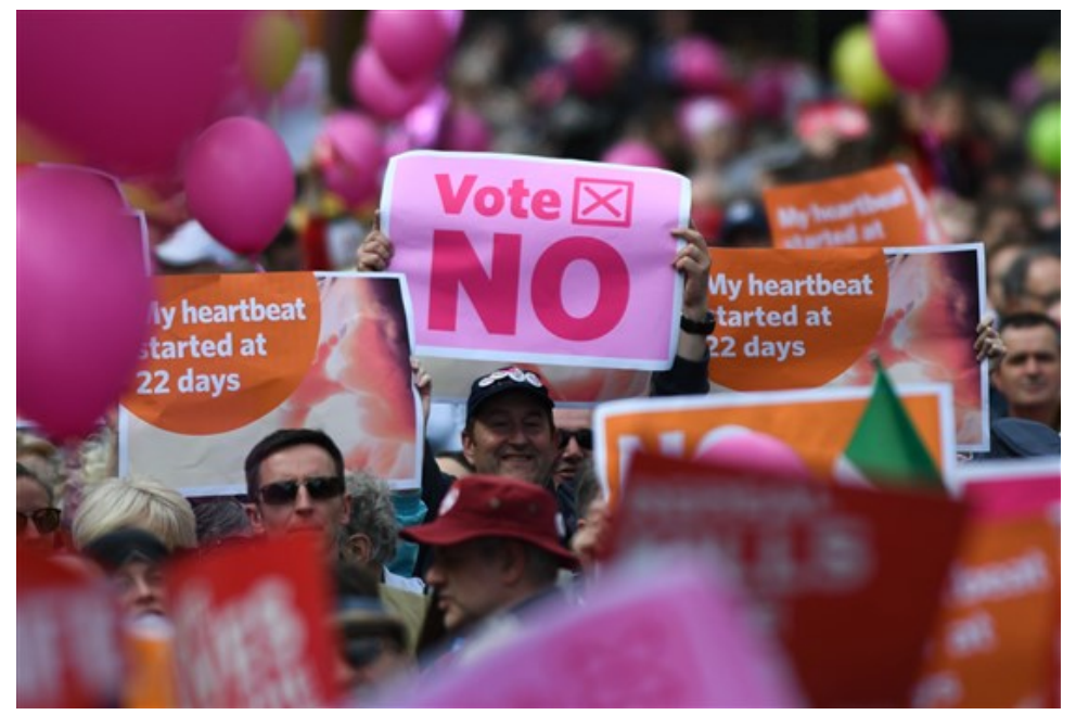
Demonstrators hold up signs "Vote No" signs at an anti-abortion rights rally in Dublin on May 12.

"We don't have a choice," he told attentive faces in the church's busy pews. "Either we are for Christ or we are against him."