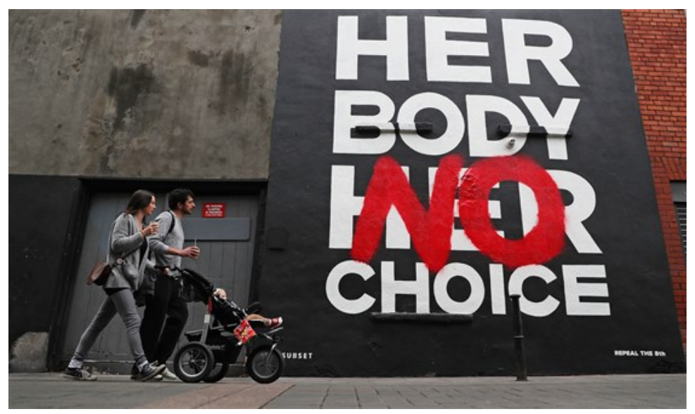
A mural calling for repeal of the Eighth Amendment in Dublin, Ireland.

The 25-year-old said not being able to tell her parents was heartbreaking.