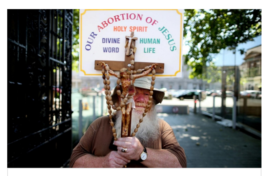
A demonstrator in Dublin before a 2013 parliamentary vote on abortion.

Over the last few years, as rallies and protests have become increasingly common on both sides of the abortion debate, a vision of Ireland shared by some anti-abortion activists has snapped into focus: Ireland as an anti-abortion success story