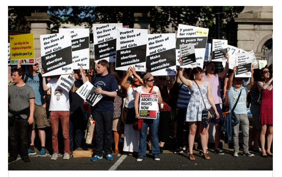
Abortion-rights supporters in front of the gates of the Irish parliament, in Dublin in 2013.

information about abortion services abroad and help women determine the best time and method for accessing clinics. Clients are asked to contribute as much as they can: In 2014 its average grant was 225 pounds