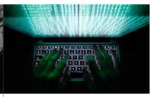
Senate passes bill to push sharing of information on hacker threats