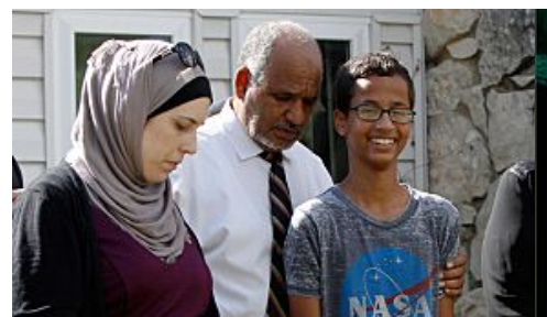
Texas teen arrested for homemade clock moving to Qatar