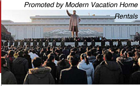
North Korea Revisited: An Unknown Land