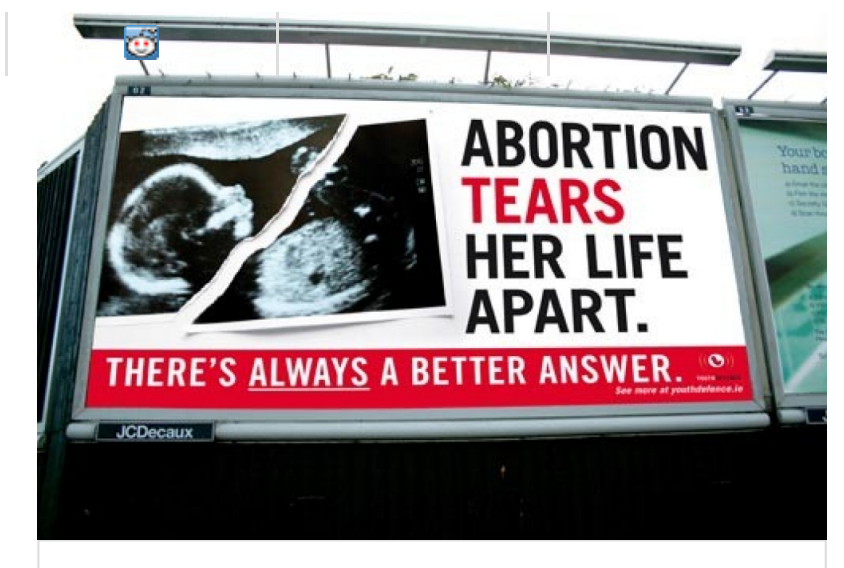
One of the anti-abortion billboards created by Youth Defence and the Life Institute.

began to appear in June 2012, featuring images of a crying woman or an unborn fetus torn into pieces. They showed up in cities and rural towns across Ireland, insisting that "there's always a better answer" than abortion. Similar advertisements materialized in buses, trams and train stations. A few months later, anti-abortion leaflets were distributed to a million private