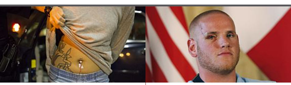
Los Angeles ends arrests of minors trafficked into sex trade