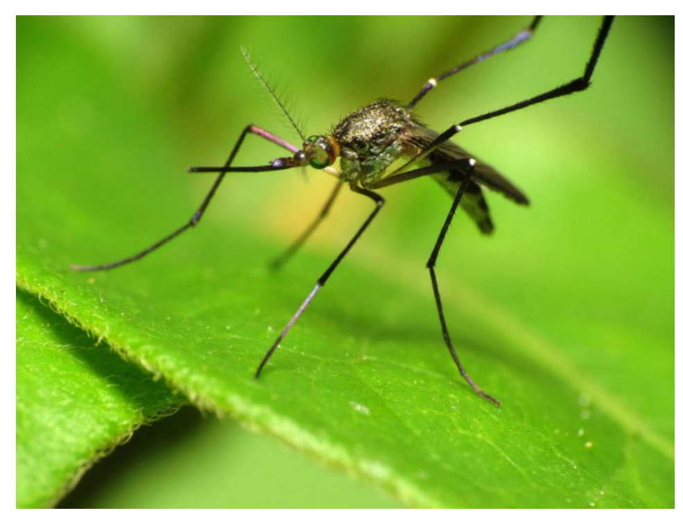
he vast majority of Latin American countries have strict laws against abortions.

In Brazil women who are found to have performed an illegal abortion can face up to 3 years in state prison. Abortion is accepted if the fetus is dead inside the wound, brain dead or the mom was raped.