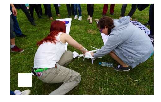
(Women on Waves)