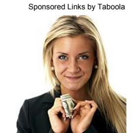
Experts Use This Trick to Pay Off Their Mortgage. It Might Surprise You! AmeriVALUE