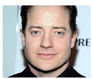
20 Stars Who Are Aging Terribly...#6 Will Make You Cringe! PressRoomVIP