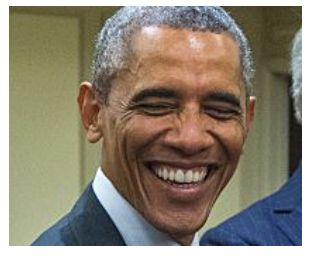
New Law Cracks Down on Right to Use Cash Bonner & Partners