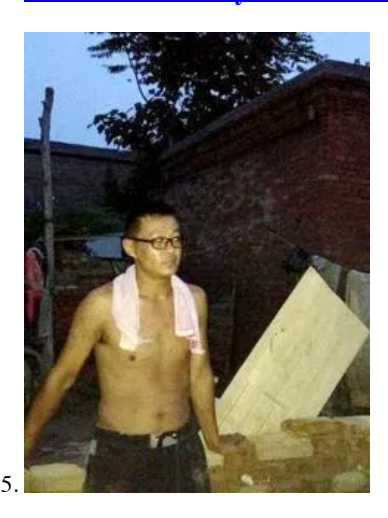
Man forced to choose between saving mother or wife in deadly floods