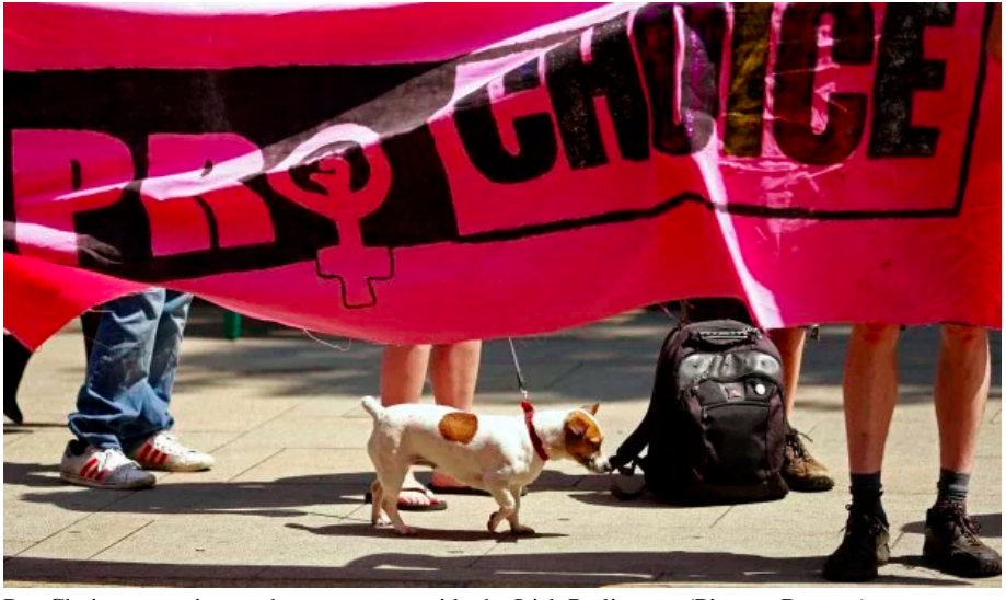
Pro-Choice campaigners demonstrate outside the Irish Parliament