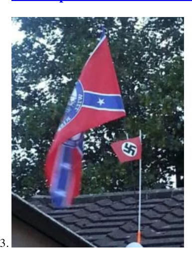
A Nazi flag has been spotted flying high at a home in Cheltenham