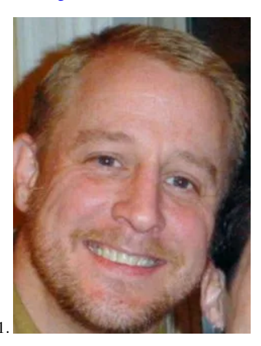
Airline passenger left with egg on his face following backfired complaint

What's trending now More trending stories »