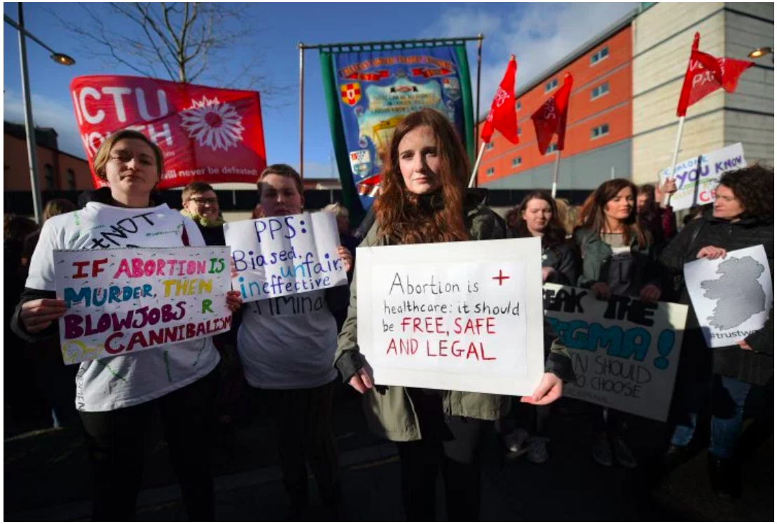
Pro-choice supporters protest outside the Public Prosecution Office in Belfast, Northern Ireland

As pressure for Ireland to repeal the Eighth Amendment – the law which provides unborn babies with the same rights as their mothers – grows, perhaps it's time to take a look at this powerful post about abortion.