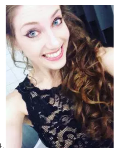
Female teacher says it's 'school's fault' that she had sex with boy, 17