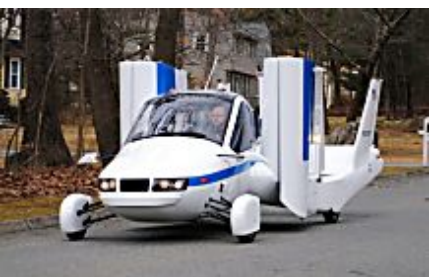
Flying Cars Soon to be a Reality ENGINEERS RULE