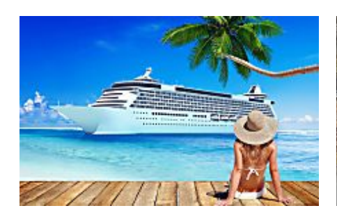
10 Cruises That Are Perfect for People Seeking Alone Time

Polish Women Went on Strike Over Terrifying Abortion Restrictions-Here's Why it Matters to Everyone | Glamour