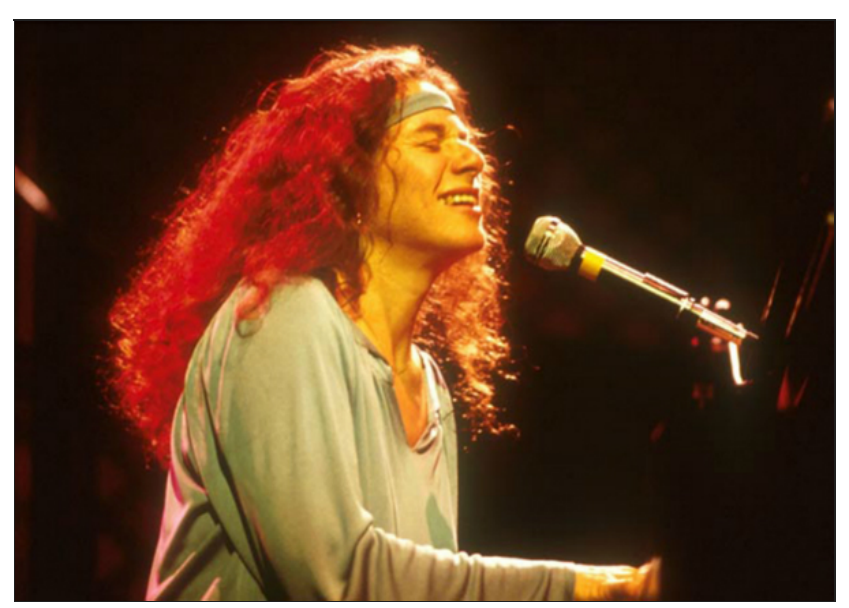
Carole King, 1971.

By the late 1960's the female contemporary singer/songwriter was a staple in mainstream music. Two such performers were Carly Simon and Carole King. Both hailed from the New York City area and wrote about the condition of women in their time with a clarity and honesty that connected with their audience. They presented themselves as women in charge on stage, accompanying themselves with either piano or guitar, no distractions. Their music was accessible, sincere, and radio-friendly in style and song length. They found their voice politically and socially.