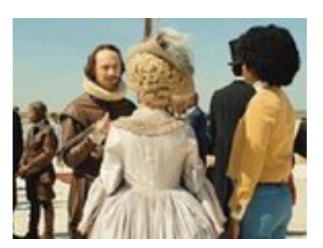
History's greatest legacies – and the questions that... betterworkingworld.ey.com