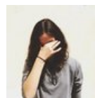
( http://www.self.com/wellness/2016/06/7-signs-you-have-low-blood-sugar/ )

The Senate Just Passed A Bill That Would Require Women To Register For A Military Draft ( http://www.self.com/trending/2016/06/women-military-draft/ )