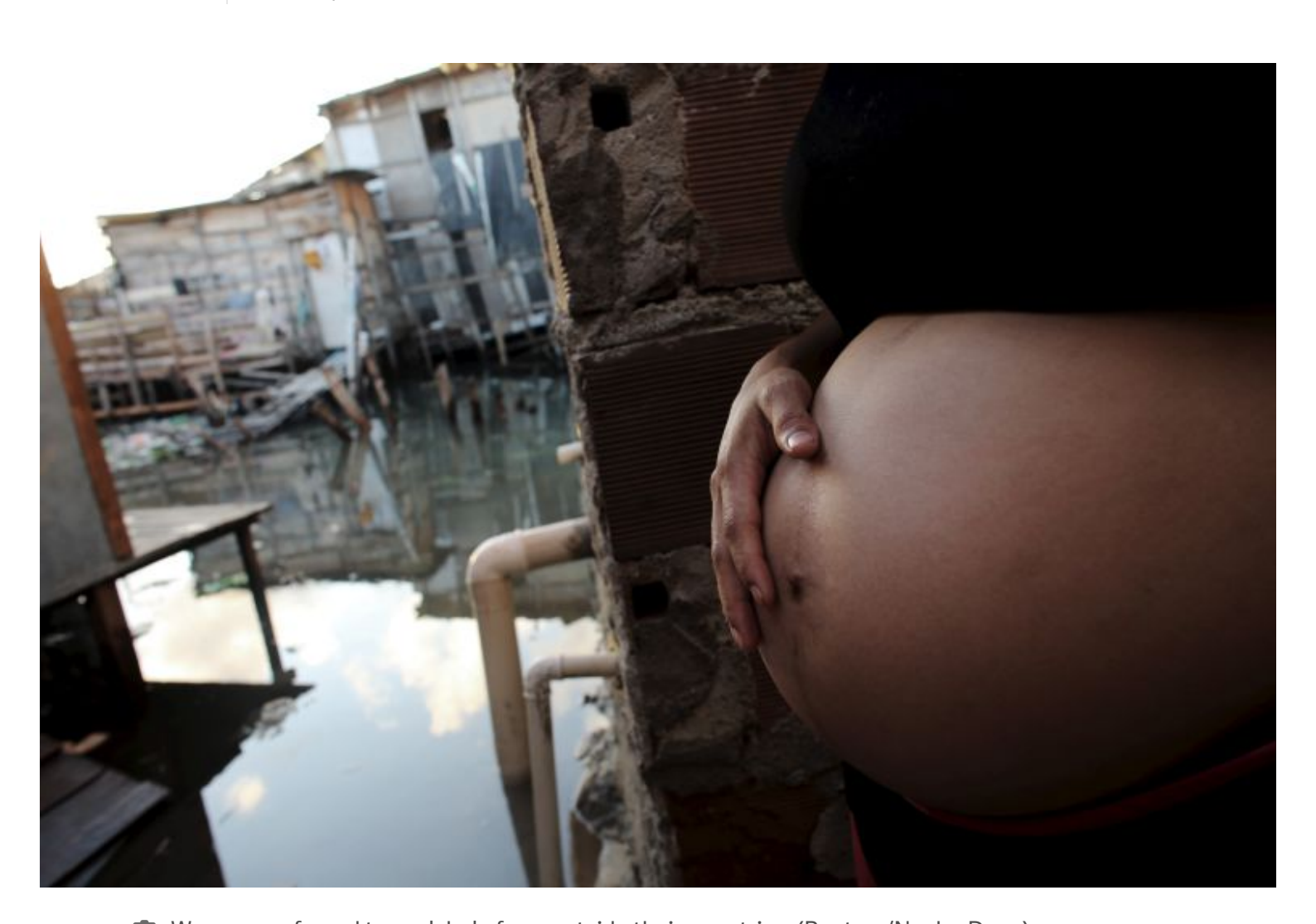
Women are forced to seek help from outside their countries.

Demand for abortions seems to have increased in the countries worst affected by