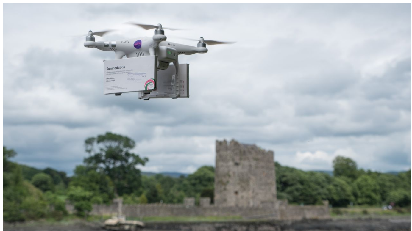
Women on Waves

By Rafi Schwartz (http://fusion.net/author/rafi-schwartz/)