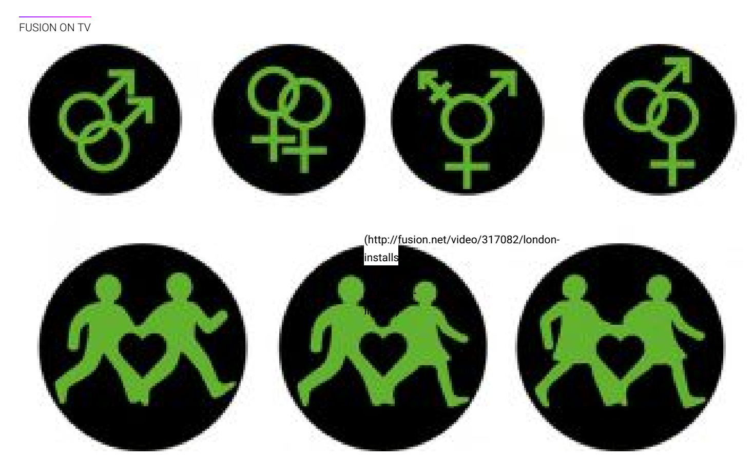
London installs LGBT crosswalk lights (http://fusion.net/video/317082/london-installs-lgbt-crosswalk-lights/)

These women are using drones to defy Northern Ireland's draconian anti-abortion laws